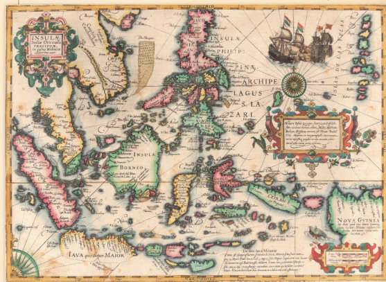
A Map of East Indies , Gerardus Mercator and Jodocus Hondius, 1613-19, Amsterdam [Second Rotation]